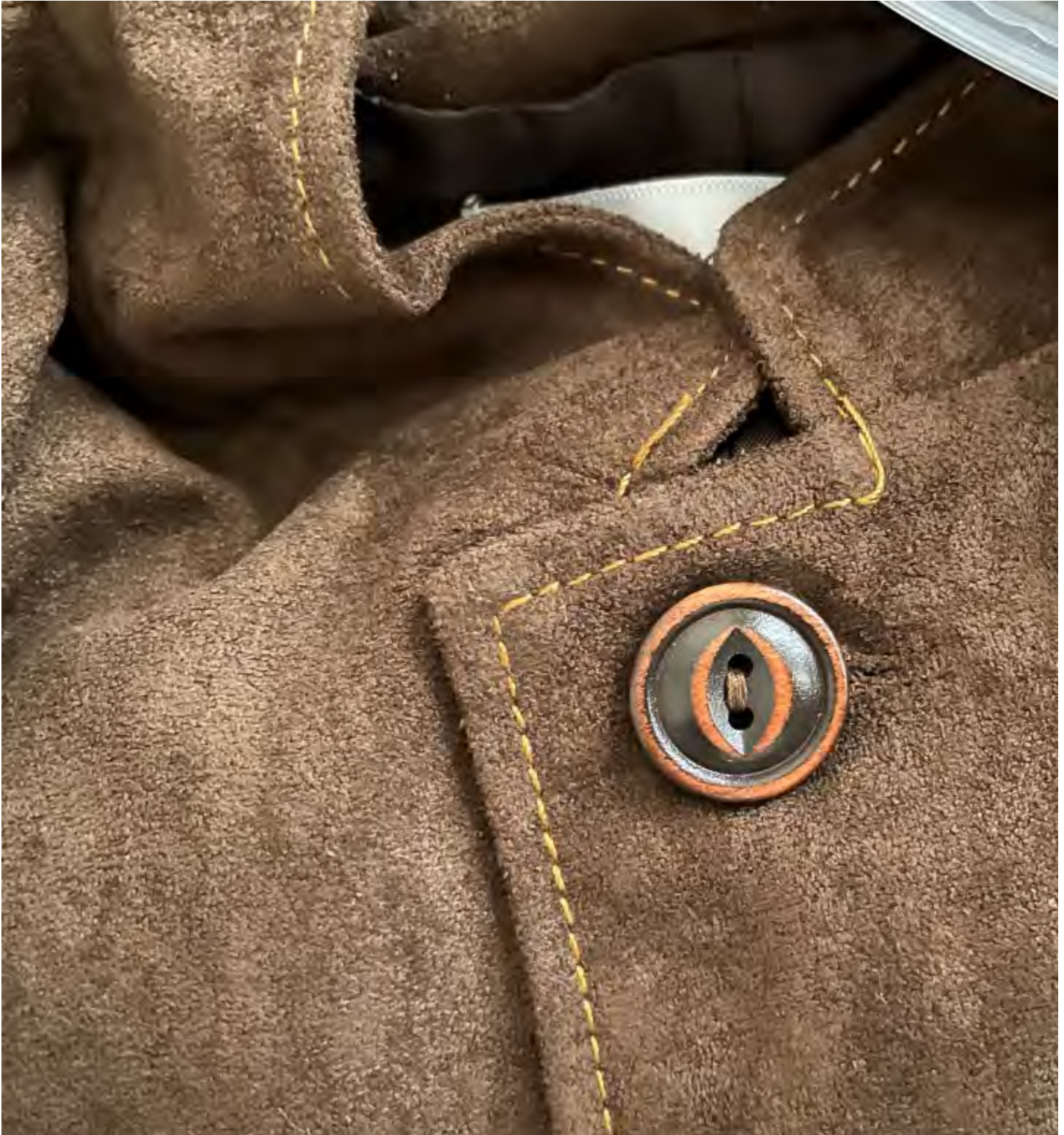
Figure 3 Product Received Detail - Hirschkogel suede jacket-Gorsuch - No Stand Collar, Poor Seam Quality, Different Buttons, Pilly Microfiber Material

The item I received was constructed of a cheap, thin microfiber material. It was not suede leather. There was no stand collar, and none of the distinctive embroidery shown in your photo. The buttons were not horn buttons. They were of an entirely different type and style than shown in the webpage photo. The seam quality was terrible, and already unraveling. The item shipped was not as described and depicted. Any variance from photograph used to market a product must be disclosed by the seller before sale. No variance was disclosed. The product shipped was different than described. Accordingly, your company committed a fraud by deception.