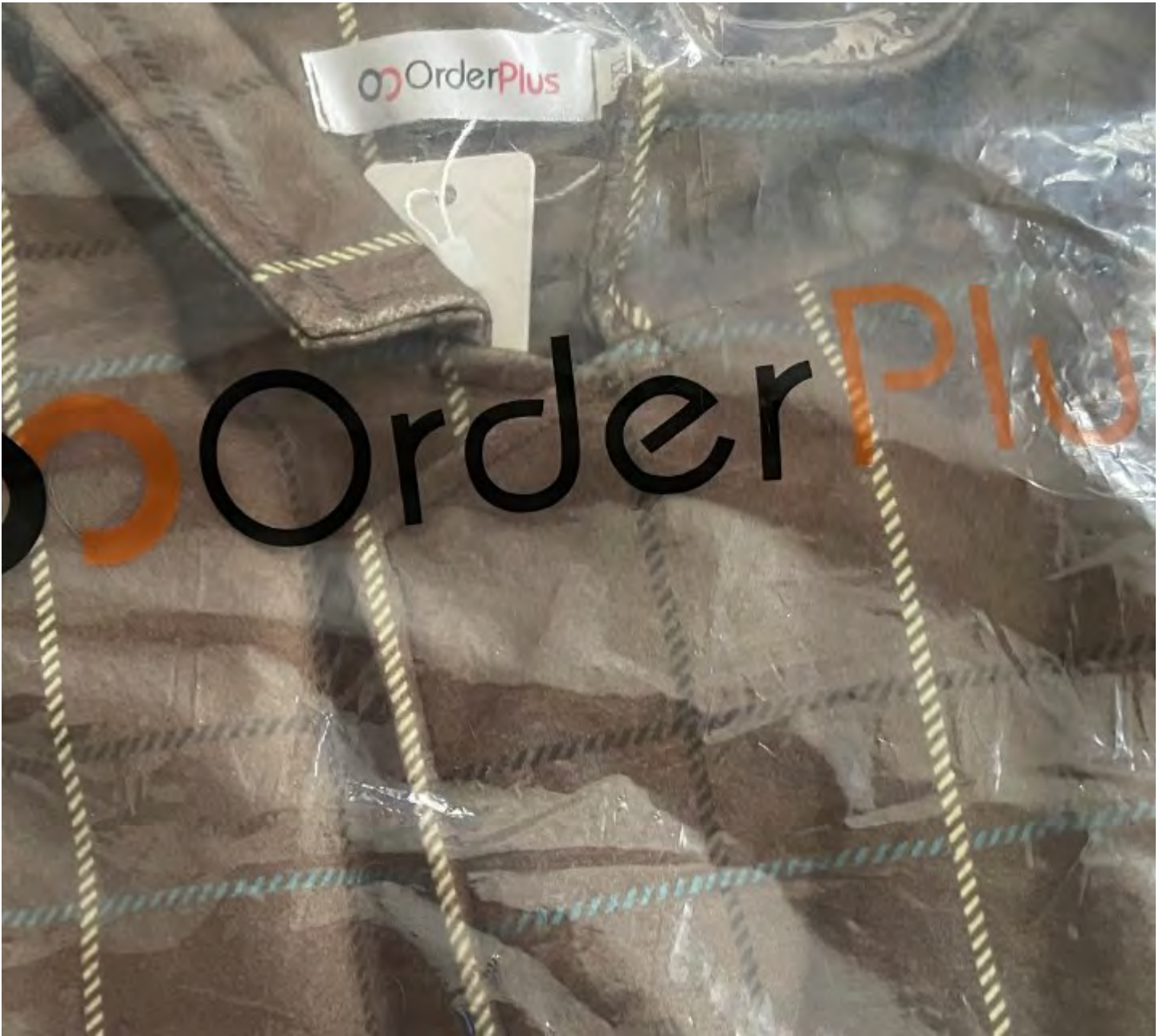
Figure 5 Product Received Detail - Printed Color Formal Vest - Lapel, Seam, and Print Delamination Detail