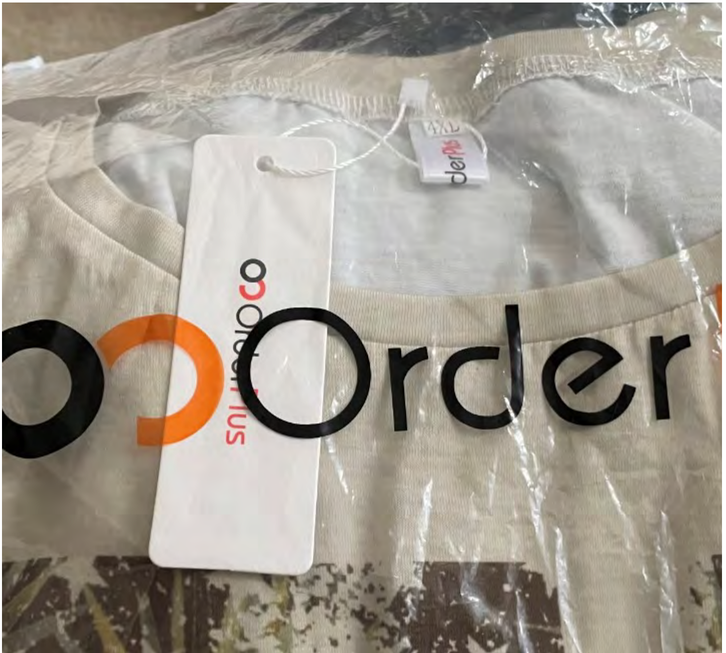
Figure 10 Product Received Detail - Printed tactical short-sleeved T-shirt

Refund Guarantee within 24 Hours Made by ORDERPLUS INTERNATIONAL LIMITED in PayPal Resolution Center Not Honored