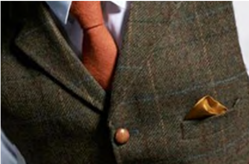
Figure 4 Cozystylelife.com Product Detail Depicted - Printed Color Formal Vest

The item I received was not made of an overcheck herringbone textured tweed. The material was a synthetic made to look somewhat like a tweed pattern with a flat, smooth finish. The print on the fabric was already coming off. The lapel was not notched, and had a visible seam. The body of the vest had a visible seam. The buttons on the garment you sent were flat, painted metal buttons, not of leather construction and a dome shape. The item shipped was not as described and depicted. Any variance from photograph used to market a product must be disclosed by the seller before sale. No variance was disclosed. The product shipped was different than described. Accordingly, your company committed a fraud by deception.