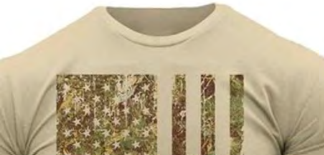
Figure 9 Cozystylelife.com Product Detail Depicted - Printed tactical short-sleeved T-shirt

The product I received had a neck that was way too large for the shirt. The fit would have left the collar edges laying out on my shoulders instead of the crew neck style expected. Portions of the screen printed pattern were already peeling off on receipt. Seams were poor quality, and already coming loose. The product shipped was different than described and unwearable.