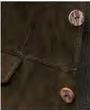
Figure 2 Cozystylelife.com Product Detail Depicted - HirschkogI suede jacket-Gorsuch - Embroidered Stand Collar