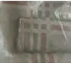
Figure 8 Product Received Detail - Men's Business Casual Plaid Vest