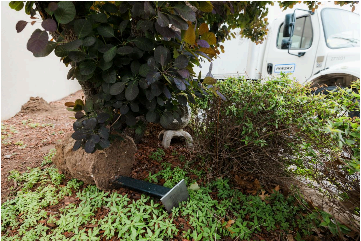
The informational plaque for the Shin'enKan gate was dug up and removed.