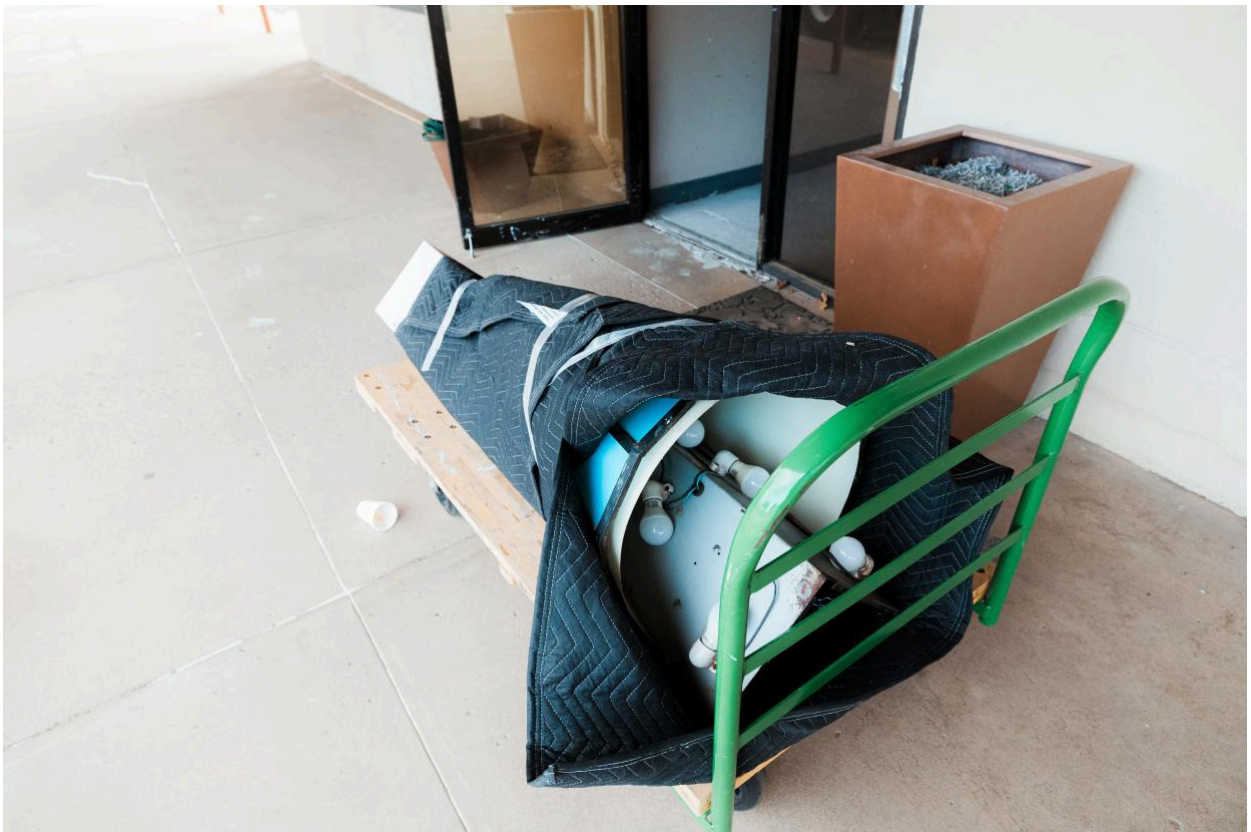
A large light was pulled out of the Price Tower storage and loaded onto a truck Wednesday evening.