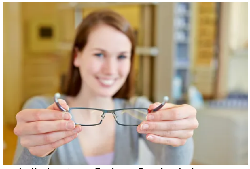
You can read all about our Re-Lens Service below.

We also offer relensing service if you are dissatisfied with your lens or need relensing service because of your prescription requirements. You can send your frames to us and we can replace the lenses in them.